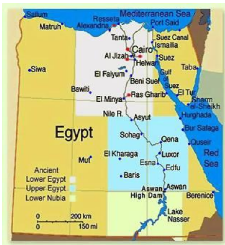
Fig (2) shows Egyptian map illustrating the different governorates that we gave lectures on 21st century skills